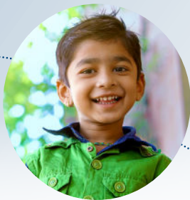
Ages 4 - 7

Ensuring educational and health needs are met during a crucial time.