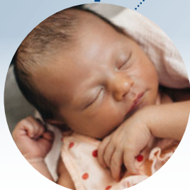
Ages 0 - 3

Advocating for the safety and wellbeing for those who don't have a voice.